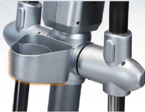
Storage Platform for Bottle Holder or Smart Phone