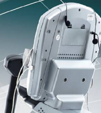
Mobile Phone & iPad Charging /Music Power Audio