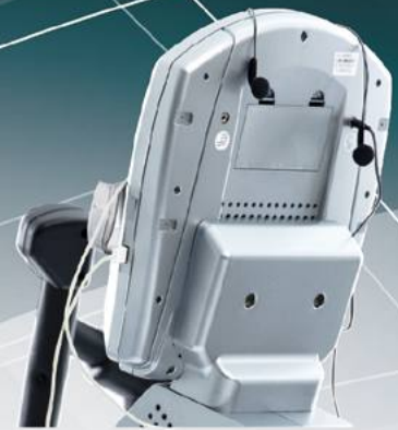
Mobile Phone & iPad Charging /Music Power Audio