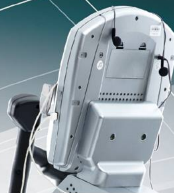
Mobile Phone & iPad Charging /Music Power Audio