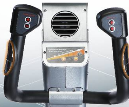
Heart Rate Monitoring (EK-Contact)