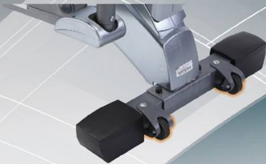
Front Transportation Moving