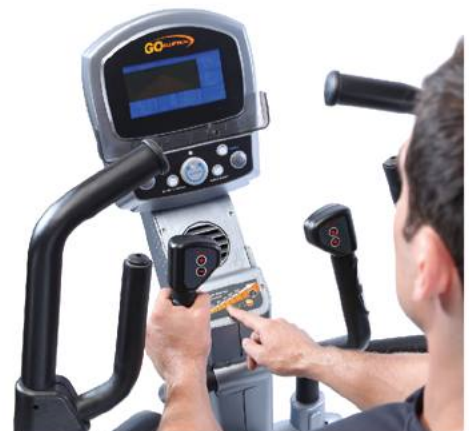
Digital VST System Stride 19"-23"