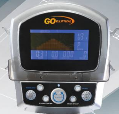
7" LCD Back LT Rotary Encoder Display Console