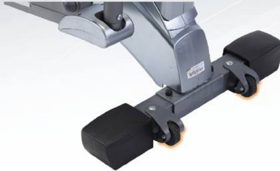
Front Transportation Moving Wheel