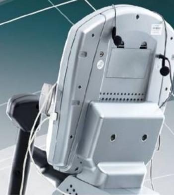
Mobile Phone & iPad Charging /Music Power Audio