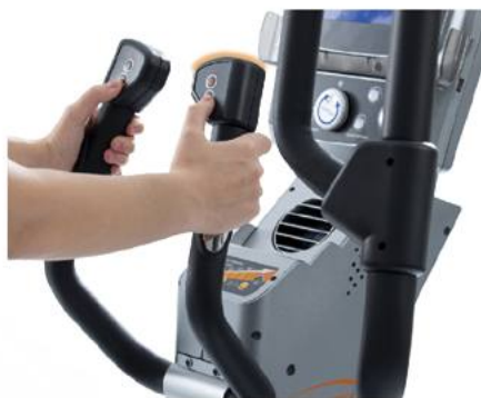
Special Toggle Switch stride & 0-24 Resistance Changeable