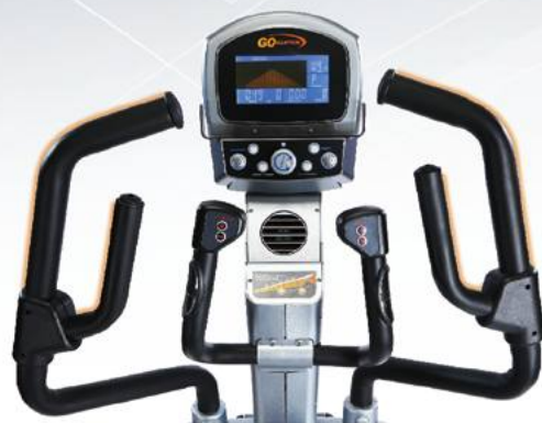
Multi-Position Dual Moving Handlebar