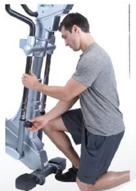
Chrome Swinging Arm W/3 Locations Changeable