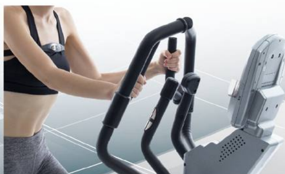
Wireless Heart Rate System