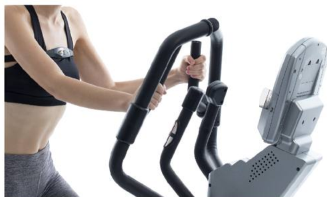
Wireless Heart Rate System