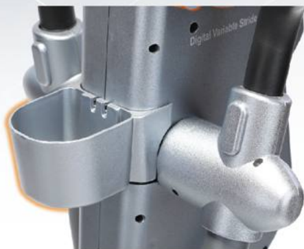
Storage Platform for Bottle Holder or Smart