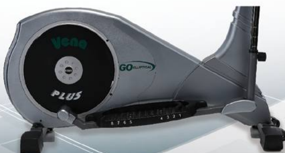
Special Silent Belt Drive 19"