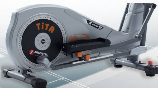
Special Silent Belt Drive 18"-22"