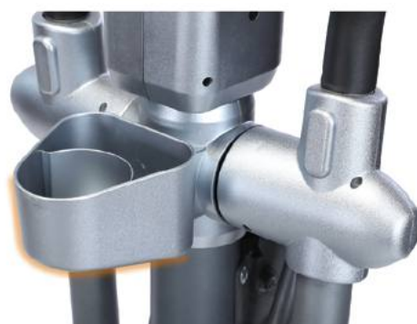
Storage Platform for Bottle Holder or Smart Phone