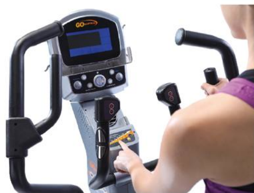
Digital VST System Stride 18"-22"