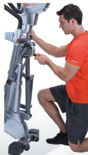
Manual VST System Stride 19"-23"