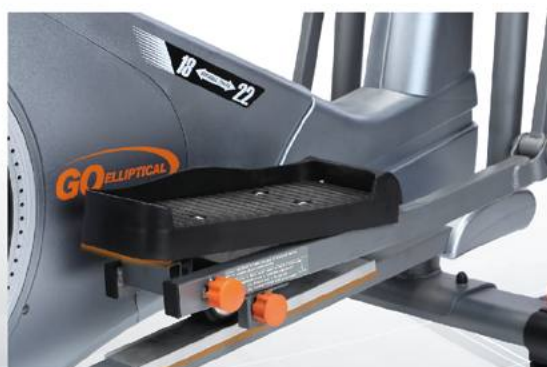
Pedal incline adjustment 0-6°