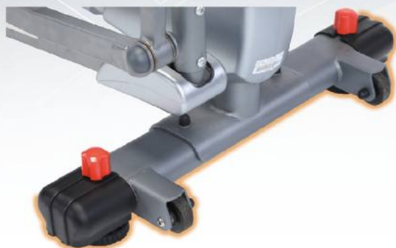
Front Transportation Moving Wheel