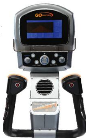
Special Toggle Switch Stride & 0-24 Resistance Changeable