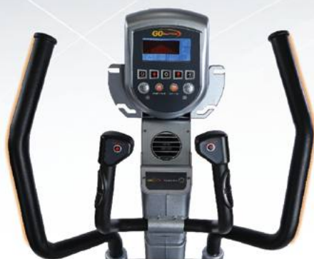
Ergo-Club-Type Handlebar W/Mist Biomechanical