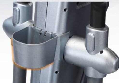
Storage Platform for Bottle Holder or Smart Phone