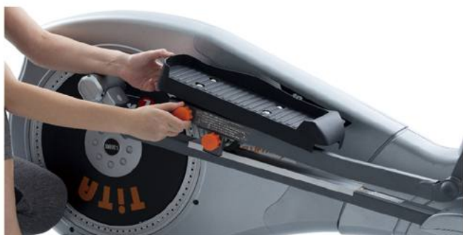
Pedal incline adjustment 0-6°