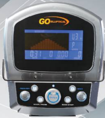
7" LCD Back LT Rotary Encoder Display Console