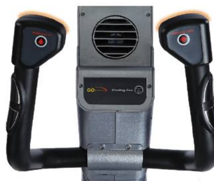
0-24 Resistance Level Special Toggle Switch