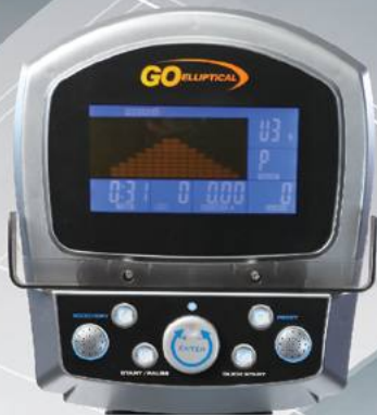
7" LCD Back LT Rotary Encoder Display Console