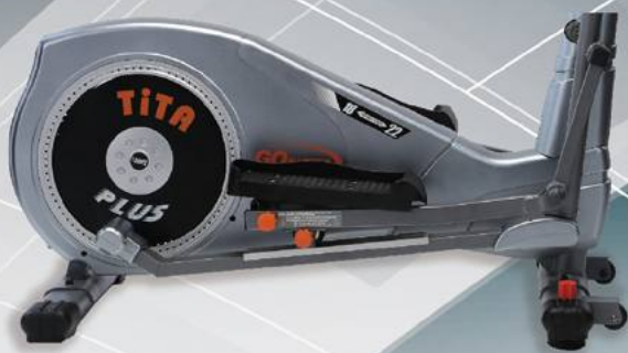
Special Silent Belt Drive 18"-22"