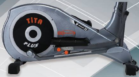
Special Silent Belt Drive 19"-23"