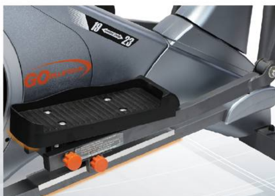
Pedal incline adjustment 0-6°