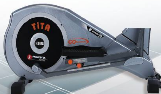
Special Silent Belt Drive 19"-23"