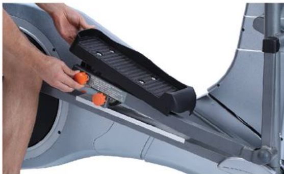
Pedal incline adjustment 0-6°