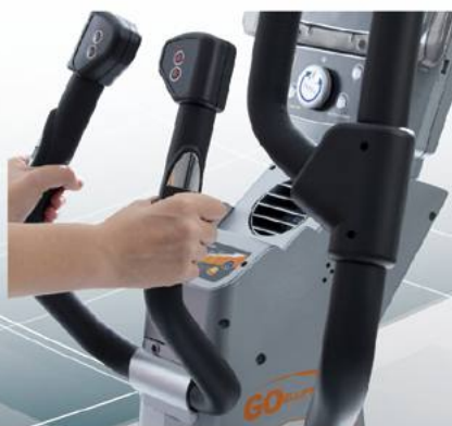
Heart Rate Monitoring (EK-Contact)