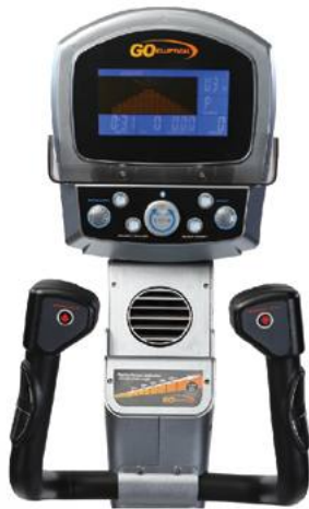
Special Toggle Switch Stride & 0-24 Resistance Changeable