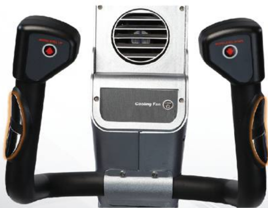
Heart Rate Monitoring (EK-Contact)