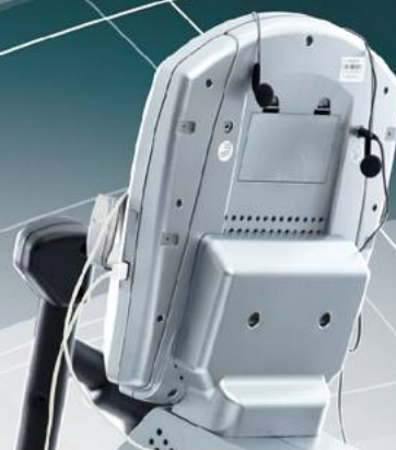
Mobile Phone & iPad Charging /Music Power Audio