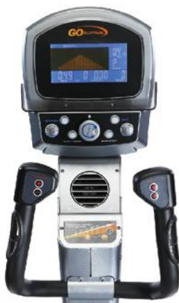
Special Toggle Switch Stride & 0-24 Resistance Changeable