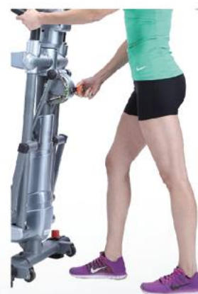
Manual VST System Stride 18"-22"