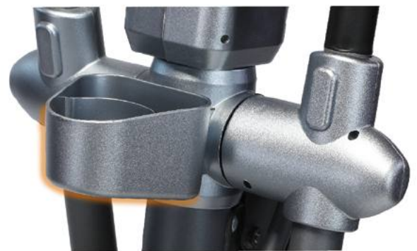
Storage Platform for Bottle Holder or Smart Phone