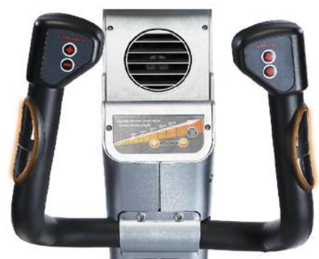
Heart Rate Monitoring (EK-Contact)