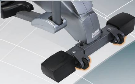
Front Transportation Moving Wheel