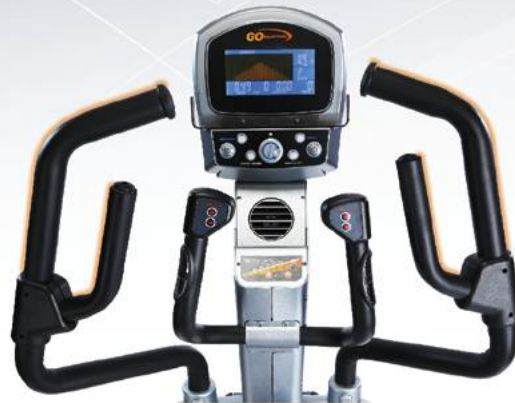
Mult-Position Dual Moving Handlebar