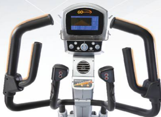
Mult-Position Dual Moving Handlebar