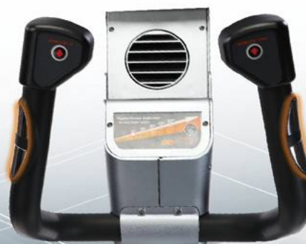
Heart Rate Monitoring (EK-Contact)