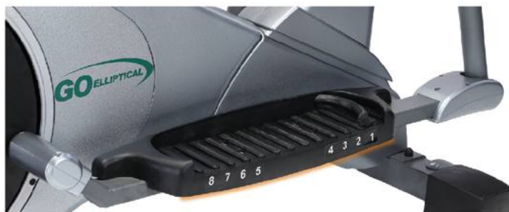
Super Size Pedal Eight Location Changeable